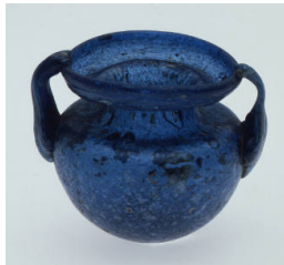
Title: Aryballos Date: 2nd century Medium: Blown dark-blue glass with applied handles