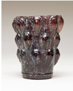
Title: Beaker Date: 1st - 2nd century Medium: Mold-blown purple glass with lotus bud/almond knop design