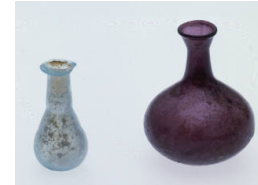
Title: Flask Date: 1st century Medium: Clear purple glass