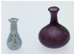
Title: Unguentarium Date: 1st century Medium: Clear blue glass