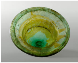
Title: Ancient Glass Bowl Date: n.d.