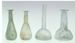
Title: Unguentarium Date: 1st - 2nd century Medium: Clear yellow glass