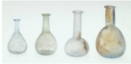
Title: Unguentarium Date: 2nd - 3rd century Medium: Clear yellow glass