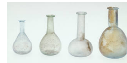
Title: Unguentarium Date: late 2nd century Medium: Clear green glass