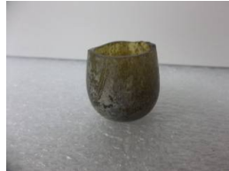
Title: Glass beaker Date: n.d. Medium: Green glass