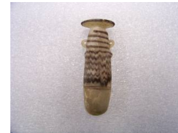
Title: Glass Alabastron Date: n.d.