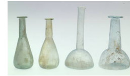
Title: Piriform Unguentarium Date: circa 300 Medium: Clear blue glass