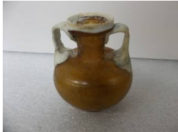
Title: Glass Amphorisk Date: n.d.