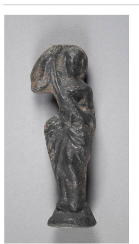
Title: Standing Draped Female Figure