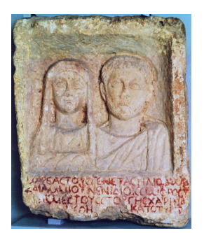
Title: Funerary Relief Date: 2nd century Medium: Limestone, tomb stele