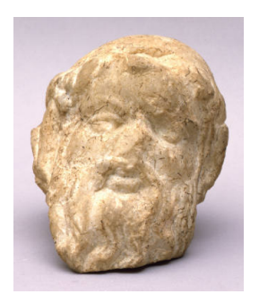
Title: Bearded Head (A Philosopher?) Date: circa 3rd century B.C.E. Medium: Marble