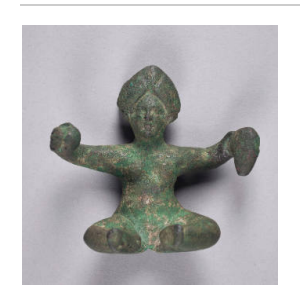
Title: Baubo Date: 1st - 2nd century Medium: Cast bronze