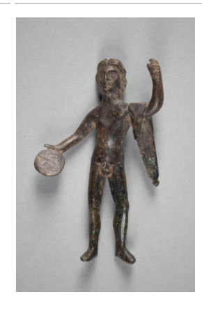
Title: Standing Nude Male Holding a Patera