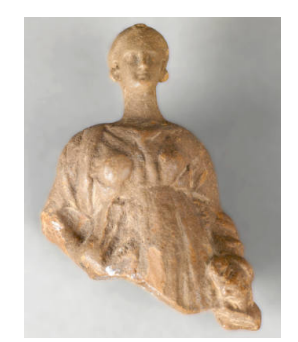
Title: Statuette Fragment: Upper Half of a Girl in a Hiton Date: circa third quarter of 5th