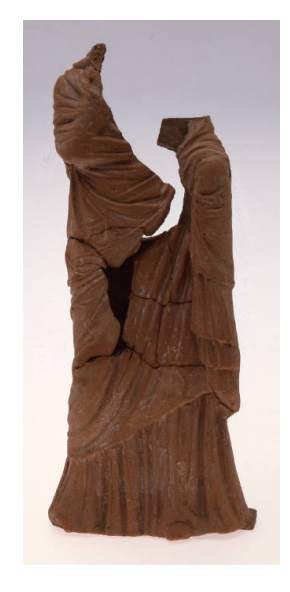
Title: Standing Draped Woman

Medium: Earthenware with slip-painted decoration