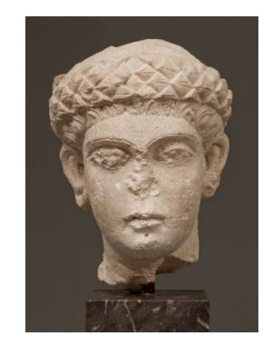
Emperor Date: 4th - 5th century C.E. Primary Maker: Unknown