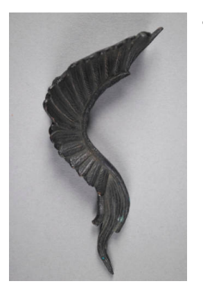
Title: Statuette Fragment: Helmet Crest Date: n.d. Medium: Bronze

Title: Statuette Fragment: Human Foot Date: before 5th century B.C.E. Medium: Cast bronze