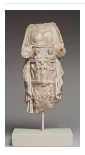
Title: Aphrodite from Aphrodisias Date: 2nd century C.E. Medium: Carved marble