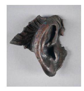
Title: Statue Fragment: Human Ear and Hair Fragment