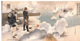
Title: General dera Attacking the Hundred Foot Cliff with All His Might (dera shgun zenryoku o furuite Hyakusekigai o shgeki suru no zu) Date: 1895 Primary Maker: Ogata Gekk Medium: Woodblock print