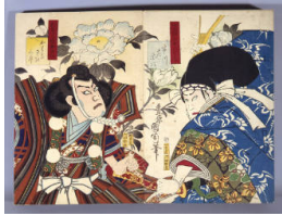
Title: Collector's Album of Prints Date: late 19th century Primary Maker: Various Artists Medium: Color woodblock prints