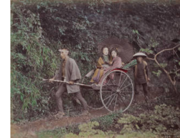
Title: Jinriki/ Yu Cascade Japan Date: 1890s Primary Maker: Unknown Artist Medium: Two hand-colored albumen prints mounted on board