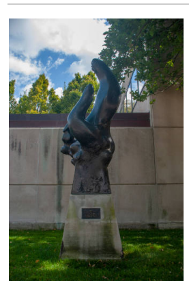
Title: Why Date: 1974

Primary Maker: Richard Hunt Medium: Bronze sculpture