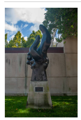
Title: Why Date: 1974

Primary Maker: Richard Hunt Medium: Bronze sculpture