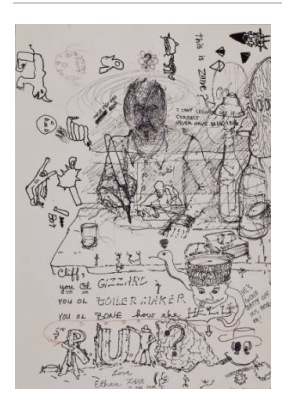
Title: Untitled (Doodle Drawing to HCW)