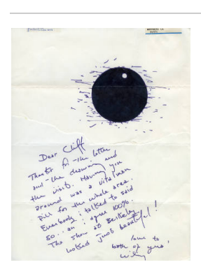
Title: letter Date: May 28, 1971