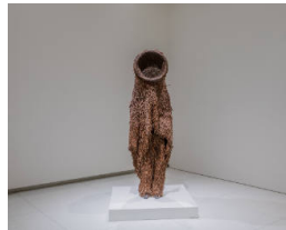
Title: Soundsuit Date: 2011 Primary Maker: Nick Cave Medium: Twigs, wire, upholstery, basket, and metal armature