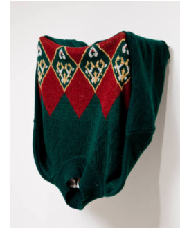
Title: Urinal from Six Famous Objects Date: 1991 Primary Maker: Erwin Wurm Medium: Acrylic sweater