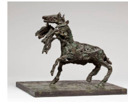
Title: Horse with Six Heads (Small Version) Date: 1956, this edition 1959 Primary Maker: Germaine Richier Medium: Cast bronze