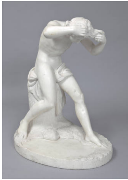
Title: Narcissus Date: 1829 - 1846 Primary Maker: Richard James Wyatt Medium: Carved marble