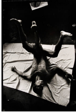
Title: East Village Beijing, 1993. No.17 Date: 2003 Primary Maker: Rong Rong () Medium: Gelatin silver print