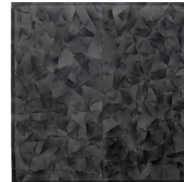
Title: Wonderland: Black Square Date: 2016 Primary Maker: Ma Qiusa Medium: Cement, nylon stockings, plywood, resin, and iron