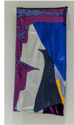
Title: Territory of Midnight Date: 2017 Primary Maker: Cauleen Smith Medium: Textile, mixed media