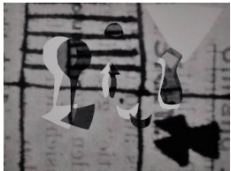
Title: Untitled Date: 1954 Primary Maker: Evelyn Statsinger Medium: Photogram