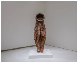
Title: Soundsuit Date: 2011 Primary Maker: Nick Cave Medium: Twigs, wire, upholstery, basket, and metal armature