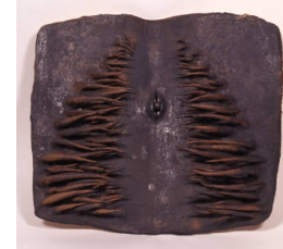
Title: Untitled Date: 1972 Primary Maker: Ruth Duckworth Medium: Glazed stoneware