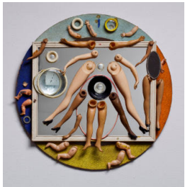
Title: Vestibule (Phenomenology of Mirrors III) Date: 1962 Primary Maker: George M. Cohen Medium: Construction in wood, glass and plastic