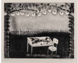
Title: There is Healing to be Done Date: 1985 Primary Maker: Hollis Sigler Medium: Vitreograph on paper