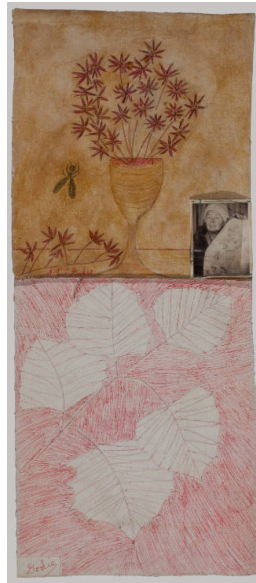
Title: Daisies / Fall Leaves