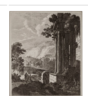
Title: Ruins of a Classical Temple