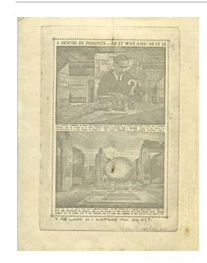
Title: carbon copy