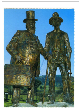
Title: postcard Date: July 1980