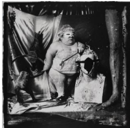
Title: Portrait of a Dwarf, Los Angeles Date: 1987 Primary Maker: Joel Peter Witkin Medium: Toned gelatin silver print