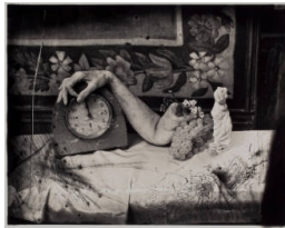
Title: Anna Akhmatova, Paris Date: 1998 Primary Maker: Joel Peter Witkin Medium: Toned silver print