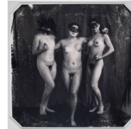
Title: The Graces, Los Angeles Date: 1988/1998 Primary Maker: Joel Peter Witkin Medium: Toned gelatin silver print