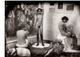
Title: Three Kinds of Woman, Mexico Date: 1992 Primary Maker: Joel Peter Witkin Medium: Toned gelatin silver print