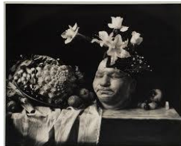
Title: Still Life, Marseilles Date: 1992 Primary Maker: Joel Peter Witkin Medium: Toned gelatin silver print