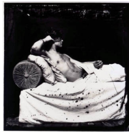
Title: Canova's Venus Date: 1982 Primary Maker: Joel Peter Witkin Medium: Manipulated gelatin silver print