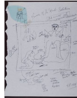
Title: Forms of the Mask (Drawing) Date: 1984 Primary Maker: Joel Peter Witkin Medium: Pen and pencil on paper.