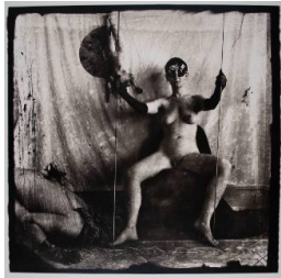
Title: Forms of the Mask: Fetishists Date: 1984 Primary Maker: Joel Peter Witkin Medium: Photo and drawing