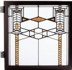
Title: West bedroom window for the Frederick C. Robie house [Robie window number 107] Date: circa 1909 Primary Maker: Frank Lloyd Wright Medium: Original wood casing with clear and colored leaded glass and original metal hardware