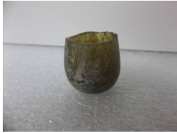
Title: Glass beaker Date: n.d. Medium: Green glass