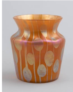
Title: Vase Date: circa 1900 Primary Maker: Glasfabrik Joh. Loetz Witwe Klostermühle Medium: Cased blown iridescent colored glass