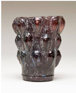
Title: Beaker Date: 1st - 2nd century Medium: Mold-blown purple glass with lotus bud/almond knob design