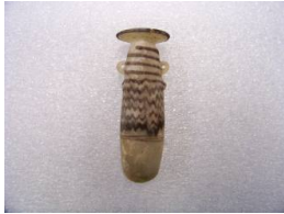
Title: Glass Alabastron Date: n.d.