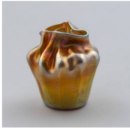
Title: Free-form Vase Date: circa 1906 - 1907 Primary Maker: Tiffany Studios Medium: Blown and crimped Favrile glass