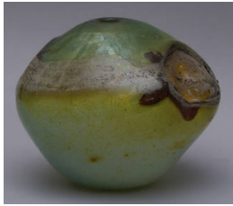
Title: Vase Date: n.d. Primary Maker: Kent Ipsen Medium: Free-blown glass