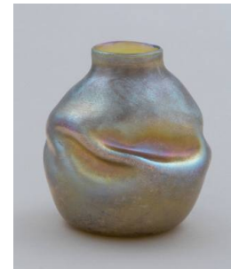
Title: Vase Date: circa 1896 - 1902 Primary Maker: Tiffany Glass and Decorating Company Medium: Blown and crimped Favrite glass