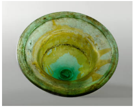
Title: Ancient Glass Bowl Date: n.d.