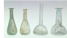
Title: Balsamarium Date: 250 - 300 Medium: Clear blue glass