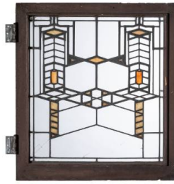
Title: Front entry hall window for the Frederick C. Robie house [Robie window number 33] Date: circa 1909 Primary Maker: Frank Lloyd Wright Medium: Original wood casing with clear and colored leaded glass and original metal hardware