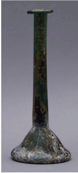
Title: Balsamarium, Candlestick type Date: 2nd - 4th century Medium: Green glass