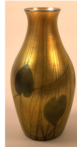
Title: Vase Date: circa 1915 - 1920 Primary Maker: Tiffany Studios Medium: Blown Favrile glass