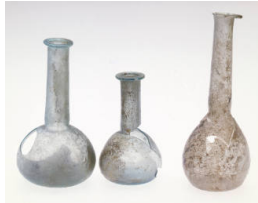
Title: Balsamarium Date: 1st century Medium: Clear glass