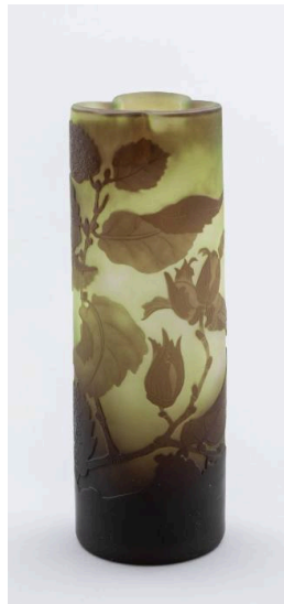
Title: Vase Date: circa 1900 Primary Maker: Emile Gallé Medium: Cased cameo-cut and acid-etched colored glass