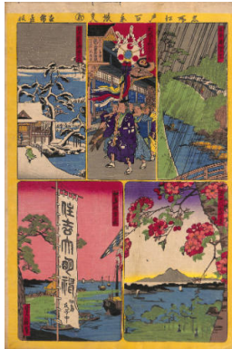
Title: Six Figures, from the Series Eiy Jynishi Date: n.d. Primary Maker: Hasegawa Sadanobu I () Medium: Woodblock print