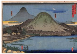
Title: Autumn Moon at Hirotsuka Pond (Hirotsuka ike aki no tsuki), from the series Famous Places in the Capital (Miyako meisho no uchi) Date: 1858 Primary Maker: Hasegawa Sadanobu I () Medium: Woodblock print