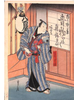
Title: B Hyakuya Hanbe Date: 1849 Primary Maker: Hasegawa Sadanobu I () Medium: Woodblock print