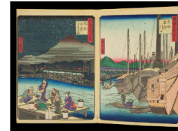
Title: Book of Landscapes Date: n.d. Primary Maker: Hasegawa Sadanobu I () Medium: Woodblock print