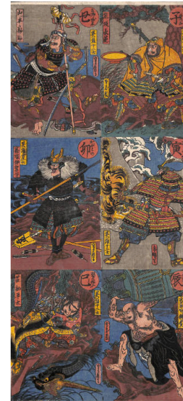
Title: Six Figures from the Series Eiy Jynishi Date: n.d. Primary Maker: Hasegawa Sadanobu I () Medium: Woodblock print