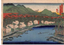
Title: Panoramic View of Arashiyama from the Triple Teahouse (Arashiyama Sangenjaya yori chb), from the series Famous Places in the Capital (Miyako meisho no uchi) Date: 1858 Primary Maker: Hasegawa Sadanobu I () Medium: Woodblock print