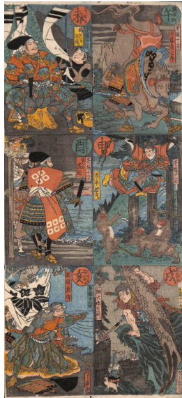
Title: Six Figures Date: n.d. Primary Maker: Hasegawa Sadanobu I () Medium: Woodblock print