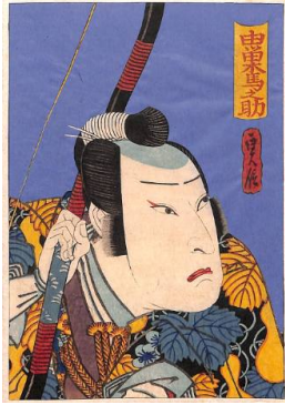
Title: Man with Bow Date: n.d. Primary Maker: Hasegawa Sadanobu I () Medium: Woodblock print