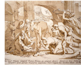
Title: Adoration of the Shepherds (after Poussin) Date: 1735 Primary Maker: Arthur Pond Medium: Etching and three color woodblock on wove paper