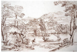
Title: River Scene with Four Men in a Boat (after Giovanni Francesco Grimaldi) Date: n.d. Primary Maker: Arthur Pond Medium: Etching on wove paper