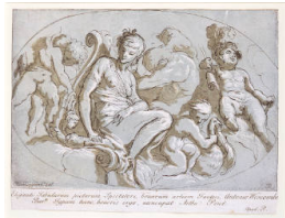
Title: Venus in Her Chariot with Amorini (after Jacopo Bertoia) Date: 1734 Primary Maker: Arthur Pond Medium: Chiaroscuro woodcut in blue and brown and etching in brown with engraved inscription in brown on off-white laid paper