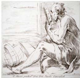
Title: Archimedes Sitting and Reading a Book (after Parmigianino) Date: n.d. Primary Maker: Arthur Pond Medium: Etching on wove paper