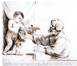
Title: The Infant Christ with St. Joseph and a Bird (after Guercino) Date: n.d. Primary Maker: Arthur Pond Medium: Etching and woodblock on wove paper