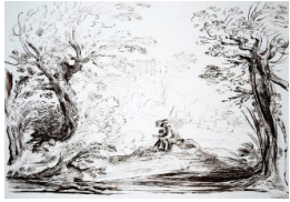
Title: Wooded Landscape With Seated Man (after Guercino) Date: 1735 Primary Maker: Arthur Pond Medium: Etching