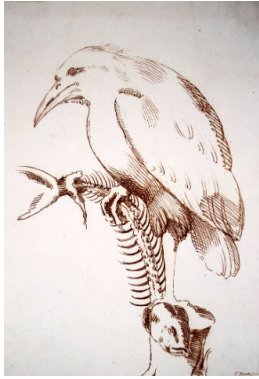
Title: A Bird on a Stump (after Giovanni da Udine) Date: 1736 Primary Maker: Arthur Pond Medium: Etching on wove paper