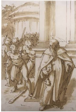
Title: St. Anthony Pursued by Demons (after Luca Cambiaso) Date: n.d. Primary Maker: Arthur Pond Medium: Etching and aquatint on laid paper