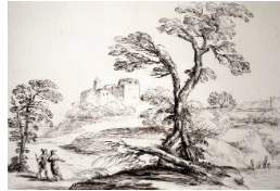
Title: Landscape With Building in the Background (after Guercino) Date: 1736 Primary Maker: Arthur Pond Medium: Etching on wove paper