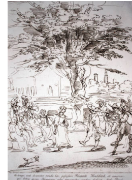
Title: Village Dance Under a Tree (after Agostino Carracci) Date: n.d. Primary Maker: Arthur Pond Medium: Etching on wove paper