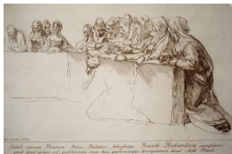
Title: Nuns at the Communion Table (?) (after Agostino Carracci) Date: n.d. Primary Maker: Arthur Pond Medium: Etching on wove paper, mounted on heavy paper