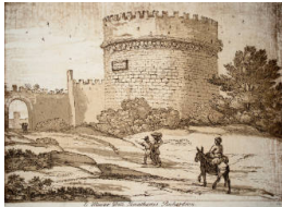
Title: The Tomb of Cecilia Metalla Rome (after Claude Lorrain) Date: 1735 Primary Maker: Arthur Pond Medium: Etching and three woodblocks on wove paper