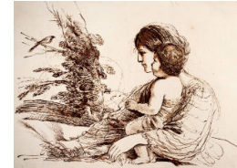
Title: Madonna and Child Watching a Bird in a Tree (after Guercino) Date: 1734 Primary Maker: Arthur Pond Medium: Etching on wove paper