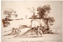
Title: Landscape with Overgrown Ruined Bridge (after Guercino) Date: n.d. Primary Maker: Arthur Pond Medium: Etching on wove paper