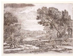
Title: Rest on the Flight into Egypt (after Claude Lorrain) Date: 1734 Primary Maker: Arthur Pond Medium: Etching in brown and woodcut in blue and gray on off-white laid paper