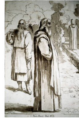
Title: Monks in a Garden (after Annibale Carracci) Date: n.d. Primary Maker: Arthur Pond Medium: Etching and three woodblocks on laid paper