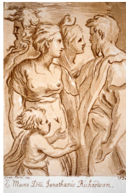
Title: Group of Five Figures (after Parmigianino) Date: 1734 Primary Maker: Arthur Pond Medium: Etching and two color woodblocks on wove paper