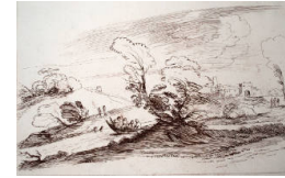
Title: Landscape Date: n.d. Primary Maker: Charles Knapp Medium: Etching on wove paper