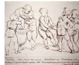
Title: Seven Putti Playing (after drawing by Raphael) Date: 1734 Primary Maker: Arthur Pond Medium: Etching on wove paper