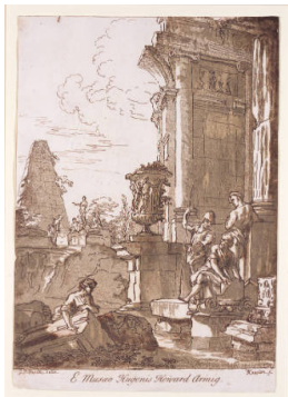
Title: Ruins with Figures (after Giovanni Paolo Panini) Date: circa 1734 - 1735 Primary Maker: Arthur Pond Medium: Etching in brown and woodcut in gray on off-white laid paper