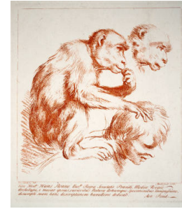
Title: Study of a Monkey on a Man's Shoulder (after Annibale Carracci) Date: 1736 Primary Maker: Arthur Pond Medium: Etching on wove paper, mounted on heavy paper