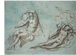
Title: Two Studies of a Reclining Male Figure (after Parmigianino) Date: n.d. Primary Maker: Arthur Pond Medium: Etching and two color woodblocks on wove paper