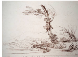
Title: Landscape with Two Seated Figures, One Holding a Hawk (after Guercino) Date: n.d. Primary Maker: Arthur Pond Medium: Print