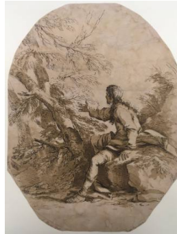
Title: St John the Baptist in the Wilderness (after Salvator Rosa) Date: 1735 Primary Maker: Arthur Pond Medium: Etching and aquatint on laid paper