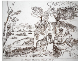
Title: Lake Shore with Three Female Figures (after Annibale Carracci) Date: 1735 Primary Maker: Arthur Pond Medium: Etching on wove paper, mounted on heavy paper