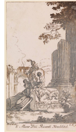
Title: Ruins of an Ionic Temple (after Giovanni Paolo Panini) Date: circa 1734 - 1735 Primary Maker: Arthur Pond Medium: Etching and chiaroscuro woodcut on wove paper