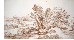
Title: River Scene with Church Tower on the Near Bank (after Giovanni Francesco Grimaldi) Date: n.d. Primary Maker: Arthur Pond Medium: Etching on wove paper