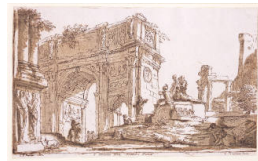
Title: Arch of Constantine, Rome (after Giovanni Paolo Panini) Date: circa 1734 - 1735 Primary Maker: Arthur Pond Medium: Etching in brown and woodcut in gray on off-white laid paper