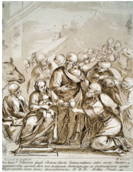
Title: The Adoration of the Magi (after Garofalo) Date: 1735 Primary Maker: Arthur Pond Medium: Etching and three woodblocks on laid paper