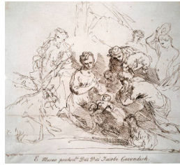
Title: Adoration of the Shepherds (after Agostino Carracci) Date: 1734 Primary Maker: Arthur Pond Medium: Etching