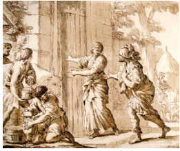
Title: Jacob and Rachel at the Well (?) (after Giovanni Francesco Romanelli) Date: 1734 Primary Maker: Arthur Pond Medium: Etching with woodblocks on wove paper