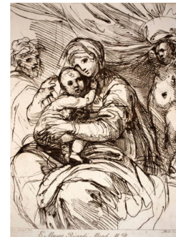
Title: Holy Family with an Angel (after Annibale Carracci) Date: 1735 Primary Maker: Arthur Pond Medium: Etching