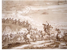
Title: Cavalry in Action (after Cortese) Date: n.d. Primary Maker: Arthur Pond Medium: Etching and two color woodblocks on wove paper