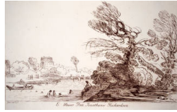
Title: River Scene with Bathers (after Guercino) Date: n.d. Primary Maker: Arthur Pond Medium: Etching on wove paper