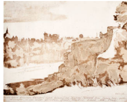
Title: View Across the Tiber Between the Dome of St. Peter's and Castel St. Angelo (after Claude Lorrain) Date: n.d. Primary Maker: Arthur Pond Medium: Etching and three-color woodblock on wove paper