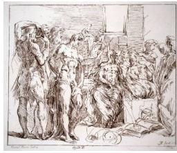
Title: Mathematicians Disputing (after Parmigianino) Date: 1734 Primary Maker: Arthur Pond Medium: Etching on wove paper