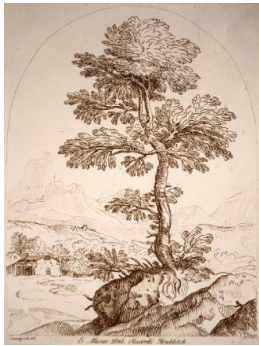
Title: Mountain Landscape (after Domenico Campagnola) Date: 1736 Primary Maker: Arthur Pond Medium: Etching