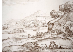
Title: River Scene with High Mountains in the Distance (after Giovanni Francesco Grimaldi) Date: n.d. Primary Maker: Arthur Pond Medium: Etching on wove paper