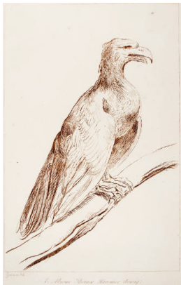
Title: Eagle on a Branch (after Guercino) Date: 1736 Primary Maker: Arthur Pond Medium: Etching on wove paper