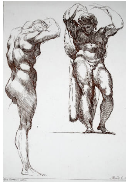
Title: Two Studies of a Male Nude Figure as a Caryatid (after Annibale Carracci) Date: 1734 Primary Maker: Arthur Pond Medium: Etching on wove paper, mounted on heavy paper