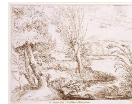
Title: River Landscape with Trees (after Annibale Carracci) Date: 1734 Primary Maker: Arthur Pond Medium: Etching with engraved inscriptions in brown on off-white laid paper