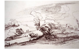
Title: Landscape with Four men in a Canoe (after Guercino) Date: n.d. Primary Maker: Arthur Pond Medium: Etching on wove paper