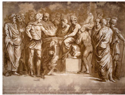
Title: Mutius Acaevola (after Polidoro da Caravaggio) Date: 1735 Primary Maker: Arthur Pond Medium: Etching and three-color woodblock on wove paper