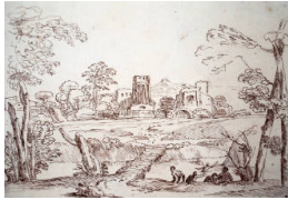
Title: River Scene with Bathers (after Giovanni Francesco Grimaldi) Date: n.d. Primary Maker: Arthur Pond Medium: Etching on wove paper