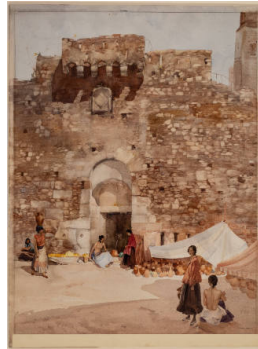
Title: Sicilian Fountain Date: n.d. Primary Maker: William Russell Flint Medium: Watercolor