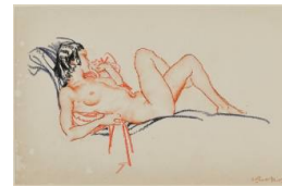
Title: Model for Zenobia Date: n.d. Primary Maker: William Russell Flint Medium: Crayon