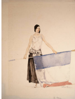
Title: La France Date: n.d. Primary Maker: William Russell Flint Medium: Watercolor on laid paper