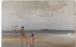
Title: Conversation on Shrimps Date: n.d. Primary Maker: William Russell Flint Medium: Watercolor on wove paper mounted on board