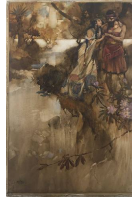
Title: By the Fishpools of Heshbon, from the Songs of Solomon Date: 1908 Primary Maker: William Russell Flint Medium: Watercolor