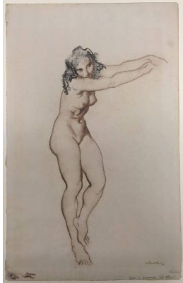
Title: Andromeda (Study for) Date: n.d. Primary Maker: William Russell Flint Medium: Crayon on laid paper