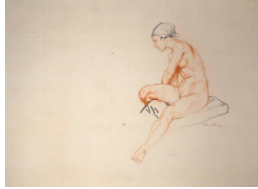
Title: A Bather Date: n.d. Primary Maker: William Russell Flint Medium: Crayon on laid paper