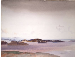
Title: The Rising Veil, Summer Isles Date: n.d. Primary Maker: William Russell Flint Medium: Watercolor on heavy board