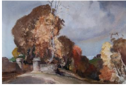
Title: The Old Entrance, Great Englebourne Date: October 1940 Primary Maker: William Russell Flint Medium: Watercolor