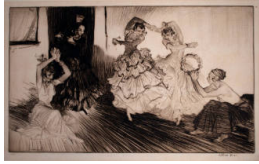
Title: Clatter and Whirl Date: n.d. Primary Maker: William Russell Flint Medium: Drypoint on wove paper