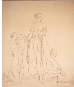
Title: Phryne Date: n.d. Primary Maker: William Russell Flint Medium: Etching on wove paper