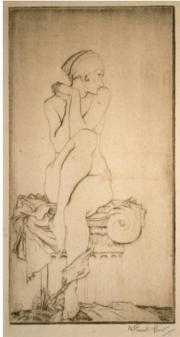
Title: Nude Woman Seated on Ionic Capital Date: 1928 Primary Maker: William Russell Flint Medium: Etching on laid paper