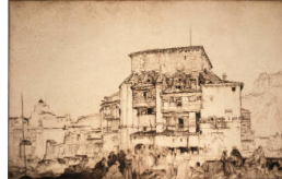
Title: Dwelling in Aragon Date: n.d. Primary Maker: William Russell Flint Medium: Etching and drypoint on laid paper