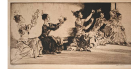
Title: Gypsy Chorus Date: n.d. Primary Maker: William Russell Flint Medium: Drypoint on laid paper