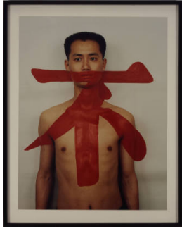
Title: Tattoo 1