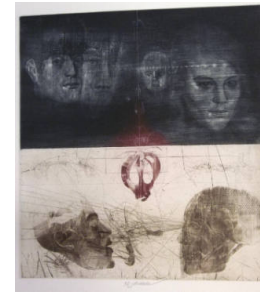
Title: Good Luck Date: 1970 Primary Maker: Jirí Anderle Medium: Drypoint and mezzotint on wove paper