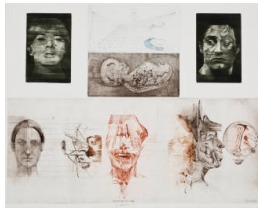
Title: Our Generation-Perspective No. 8 Date: 1972 Primary Maker: Jirí Anderle