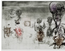
Title: Game Series: TV Game Date: 1975 Primary Maker: Jirí Anderle Medium: Drypoint and mezzotint on copper