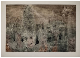
Title: Appassionata Date: 1977 Primary Maker: Jirí Anderle Medium: Drypoint and mezzotint