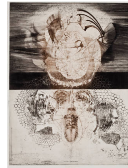
Title: Perspective No. 4--Cogito Ergo Sum Date: 1971 Primary Maker: Jirí Anderle Medium: Drypoint and mezzotint on copper