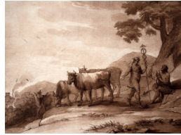
Title: Landscape with Mercury and Apollo Date: 1803 (designed), 1819 (published) Primary Maker: Richard Earlom Medium: Etching on laid paper