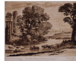
Title: Herdsman Driving Cattle Through a River (after Claude Lorrain) Date: 1776 (design); 1777 (published) Primary Maker: Richard Earlom Medium: Etching and mezzotint in brown on cream laid paper