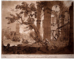
Title: Landscape with Temptation of St. Anthony (after Claude Lorrain)