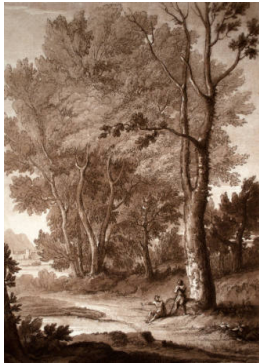
Title: Landscape with Two Men Resting Under a Tree