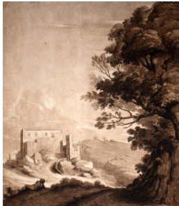
Title: Landscape with Ruined Castle Date: 1807 (designed), 1819 (published) Primary Maker: Richard Earlom Medium: Etching