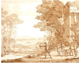
Title: Landscape with Aeneas Shooting a Stag (after Claude Lorrain) Date: 1734 Primary Maker: Arthur Pond Medium: Etching and woodblocks on heavy laid paper