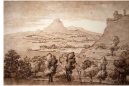
Title: Landscape with Sea, Mountains and a Castle Date: 1817 Primary Maker: Richard Earlom Medium: Mezzotint with etched line on laid paper