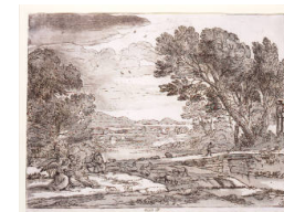
Title: Rest on the Flight into Egypt (after Claude Lorrain)