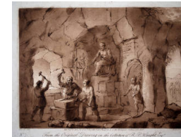
Title: Mercury in the Forge of Vulcan

Medium: Mezzotint with etched line on laid paper