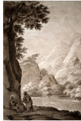
Title: Landscape with the Temptation of Christ