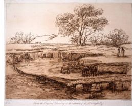
Title: Landscape with Drinking Cattle Date: 1802 (designed), 1819 (published) Primary Maker: Richard Earlom Medium: Mezzotint with etched line