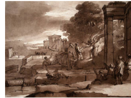
Title: Martyrdom of St. Catherine

Medium: Mezzotint with etched line on wove paper