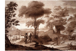
Title: Landscape with Aeneas Shooting Stag Date: 1803 (designed), 1819 (published) Primary Maker: Richard Earlom Medium: Mezzotint with etched line on laid paper