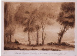
Title: Landscape with Herdsman and Cattle (after Claude Lorrain) Date: 1802 (design); 1819 (published) Primary Maker: Richard Earlom Medium: Etching and mezzotint with engraved inscription in brown on cream laid paper