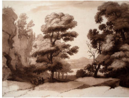
Title: Landscape with Distant View of River and Mountain Date: 1803 (designed), 1819 (published) Primary Maker: Richard Earlom Medium: Mezzotint with etched line on laid paper