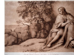
Title: Landscape with St. Mary Magdalene Date: 1819 Primary Maker: Richard Earlom Medium: Mezzotint with soft-ground etching