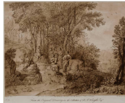
Title: Apollo and the Muses on Mount Parnassus (after Claude Lorrain) Date: 1802 (designed), 1819 (published) Primary Maker: Richard Earlom Medium: Etching and mezzotint with engraved inscription in brown on cream laid paper