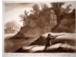
Title: Landscape with Hunter Shooting Date: 1803 (designed), 1819 (published) Primary Maker: Richard Earlom Medium: Mezzotint with etched line