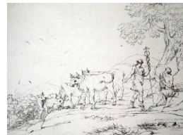
Title: Proof for Liber Veritatis Vol. III, Plate 37