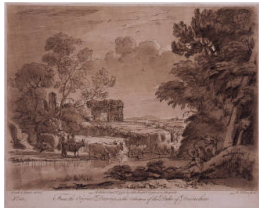
Title: Landscape with an Artist Drawing in the Foreground (after Claude Lorrain) Date: 1775 (design); 1819 (published) Primary Maker: Richard Earlom Medium: Etching and mezzotint