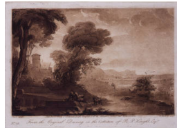
Title: Landscape with a Traveler Resting by a Bridge (after Claude Lorrain) Date: 1803 (designed), 1819 (published) Primary Maker: Richard Earlom Medium: Etching with mezzotint on cream laid paper