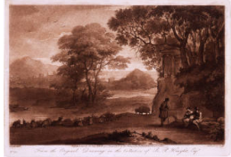
Title: Landscape with Resting Shepherds and Sheep Date: 1803 (designed), 1819 (published) Primary Maker: Richard Earlom Medium: Mezzotint with etched line