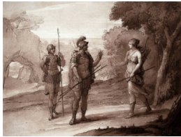
Title: Aeneas and Dido Date: 1803 (designed), 1819 (published) Primary Maker: Richard Earlom Medium: Mezzotint with etched line on laid paper