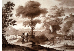
Title: Landscape with Aeneas Shooting Stag Date: 1803 (designed), 1819 (published) Primary Maker: Richard Earlom Medium: Mezzotint with etched line on wove paper