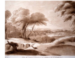
Title: Landscape with Buildings in the Distance Date: 1802 (designed), 1819 (published) Primary Maker: Richard Earlom Medium: Mezzotint with etched line