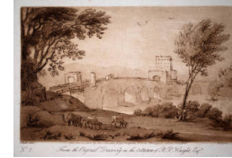
Title: Landscape with River and Bridge: the Ponte Molle (after Claude Lorrain) Date: 1802 (design); 1819 (published) Primary Maker: Richard Earlom Medium: Mezzotint with etched line