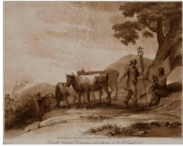
Title: Landscape with Mercury and Apollo Date: 1803 (designed), 1819 (published) Primary Maker: Richard Earlom Medium: Mezzotint with etched line on wove paper