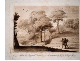
Title: Landscape with Travelers (after Claude Lorrain)