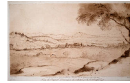
Title: Landscape with Distant Mountains Date: 1802 (designed), 1819 (published) Primary Maker: Richard Earlom Medium: Mezzotint, soft-ground etching, Roulette work