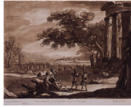
Title: Landscape with Dance of a Nymph and Satyr (after Claude Lorrain) Date: 1774 (design); 1777 (published) Primary Maker: Richard Earlom Medium: Etching and mezzotint in brown on cream laid paper