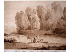
Title: Landscape with Man and a Dog by a River Date: 1802 (designed), 1819 (published) Primary Maker: Richard Earlom Medium: Mezzotint with etched line