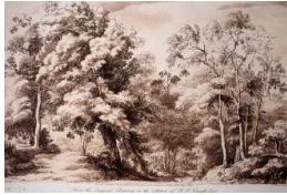
Title: The Landing of Aeneas Date: 1803 (designed), 1819 (published) Primary Maker: Richard Earlom Medium: Mezzotint with soft-ground etching