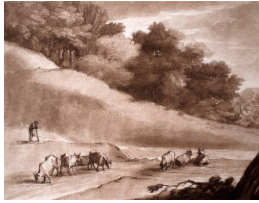
Title: Landscape with Cattle and Herdsman Date: 1803 (designed), 1819 (published) Primary Maker: Richard Earlom Medium: Mezzotint with etched line