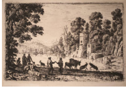
Title: Bacchanale by a Lake (after Claude Lorrain) Date: n.d. Primary Maker: Unknown Artist Medium: Reproductive engraving on laid paper