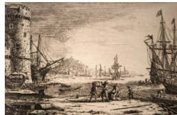
Title: Harbour Scene (after Claude Lorrain) Date: n.d. Primary Maker: Unknown Artist Medium: Engraving on laid paper