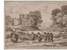
Title: Apollo Leading the Four Seasons in a Dance, While Father Time Plays the Harp Date: 1662 Primary Maker: Claude Lorrain [also called Claude Gellée] Medium: Etching with engraved inscription on cream wove paper