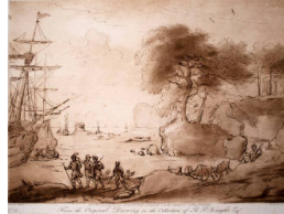
Title: Banditti on Shore of a Harbour Date: 1802 (designed), 1819 (published) Primary Maker: Richard Earlom Medium: Mezzotint with etched line