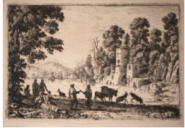
Title: Bacchanale by a Lake (after Claude Lorrain) Date: n.d. Primary Maker: Unknown Artist Medium: Reproductive engraving on laid paper