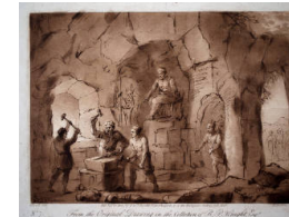
Title: Mercury in the Forge of Vulcan

Medium: Mezzotint with etched line on laid paper