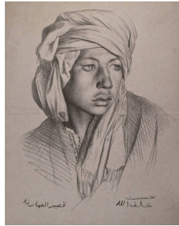
Title: Study of a Youth Wearing a Turban