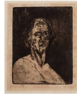
Title: Head of a Woman (Frauenkopf) Date: 1906 Primary Maker: Emil Nolde Medium: Etching