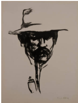
Title: Head with Pipe (Self-Portrait) (Kopf mit Pfeiffer [Selbstbildnis]) Date: 1907 Primary Maker: Emil Nolde Medium: Transfer lithograph on wove paper