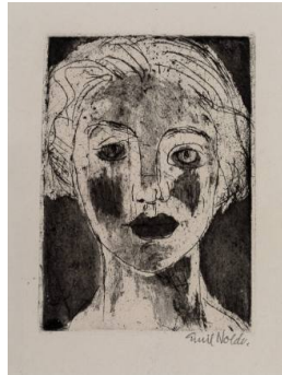
Title: Head of a Girl (Madchenbildnis) Date: 1924 Primary Maker: Emil Nolde Medium: Etching