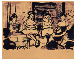
Title: Tingel-Tangel II Date: 1907 (stone, this impression from 1915 edition) Primary Maker: Emil Nolde Medium: Transfer lithograph (black) overprinted in two colors on wove paper