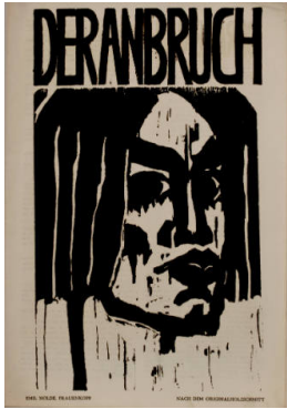
Title: Four woodcuts in Der Anbruch Date: 1919 Primary Maker: Emil Nolde Medium: Electrotpe cast from original woodcuts