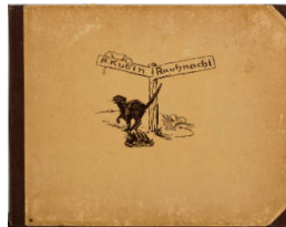
Title: Wild Night (Rauhnacht) Date: 1925 Primary Maker: Alfred Kubin Medium: Loose-leaf portfolio consisting of 13 lithographs, title sheet, foreword sheets by Otto Stoessl, and original illustrated paperboard bi-fold folio cover