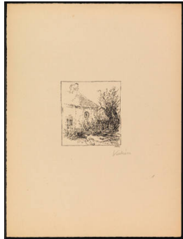
Title: A Corpse in the Countryside (Geländete Leiche) Date: 1919 Primary Maker: Alfred Kubin Medium: Lithograph