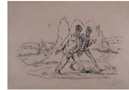
Title: Two Wandering Vagabonds (Zwei wandernde Strolche) Date: 1900/1936 Primary Maker: Alfred Kubin Medium: Lithograph