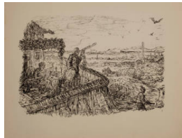
Title: Wild Night (Rauhnacht) Date: 1925 Primary Maker: Alfred Kubin Medium: Loose-leaf portfolio consisting of 13 lithographs, title sheet, foreword sheets by Otto Stoessl, and original illustrated paperboard bi-fold folio cover