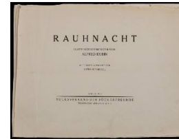
Title: Wild Night (Rauhnacht) Date: 1925 Primary Maker: Alfred Kubin Medium: Loose-leaf portfolio consisting of 13 lithographs, title sheet, foreword sheets by Otto Stoessl, and original illustrated paperboard bi-fold folio cover