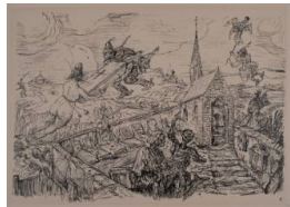
Title: Vampire (Vampyre) Date: 1925 Primary Maker: Alfred Kubin Medium: Lithograph