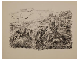
Title: Wild Night (Rauhnacht) Date: 1925 Primary Maker: Alfred Kubin Medium: Loose-leaf portfolio consisting of 13 lithographs, title sheet, foreword sheets by Otto Stoessl, and original illustrated paperboard bi-fold folio cover