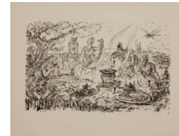
Title: Wild Night (Rauhnacht) Date: 1925 Primary Maker: Alfred Kubin Medium: Loose-leaf portfolio consisting of 13 lithographs, title sheet, foreword sheets by Otto Stoessl, and original illustrated paperboard bi-fold folio cover