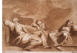
Title: Three Sleeping Figures (after Polidoro da Caravaggio) Date: 1774 Primary Maker: Stefano Mulinari Medium: Etching and engraving on laid paper