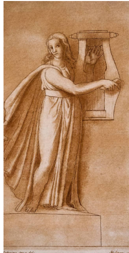
Title: A Muse with a Lyre (after Maturino da Firenze) Date: 1774

Medium: Etching and aquatint on laid paper