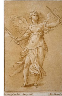
Title: Nymph Shooting a Bow (after Parmigianino) Date: 1774

Medium: Etching and aquatint on laid paper