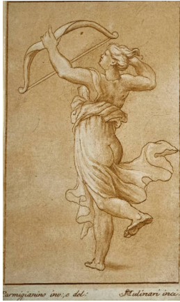
Title: Winged Female with Two Swords (after Parmigianino) Date: 1774 Primary Maker: Stefano Mulinari Medium: Etching on laid paper