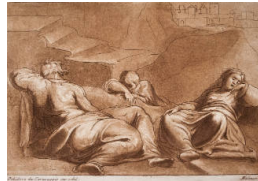
Title: Three Sleeping Figures (after Polidoro da Caravaggio) Date: 1774 Primary Maker: Stefano Mulinari Medium: Etching and engraving on laid paper