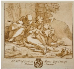
Title: Holy Family in a Landscape with Young St. John the Baptist (after Luca Cambiaso) Date: n.d.

Medium: Etching and aquatint on laid paper