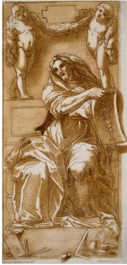
Title: The Prophet Isaiah (after drawing by Federico Zuccaro after Raphael) Date: 1774 Primary Maker: Stefano Mulinari Medium: Etching