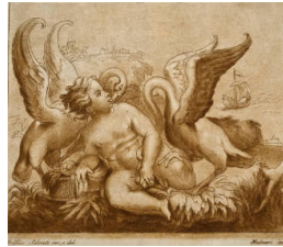
Title: A Boy Between Two Swans (after Francesco Salviati) Date: 1774

Medium: Etching and aquatint on laid paper