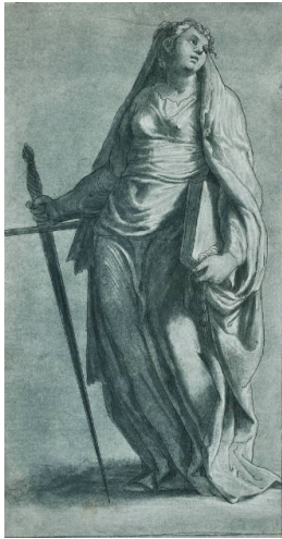
Title: Allegorical Figure, Justice (after Francesco Salviati) Date: 1774