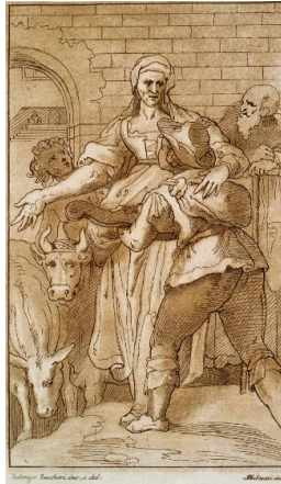
Title: A Youth with a Yoke (after Federico Zuccaro) Date: 1774 Primary Maker: Stefano Mulinari Medium: Etching on laid paper