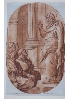
Title: St. Paul Preaching (after Perino del Vaga) Date: 1774 Primary Maker: Stefano Mulinari Medium: Etching and aquatint on laid paper