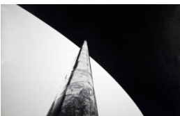
Title: Bridge Detail No. 2 Date: 1925 Primary Maker: Lennart Olson Medium: Gelatin silver print