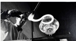
Title: Glass Blowing Date: 1925 Primary Maker: Lennart Olson Medium: Gelatin silver print