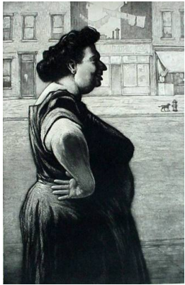
Title: Boss of the Block Date: circa 1939 Primary Maker: Martin Lewis Medium: Drypoint and aquatint