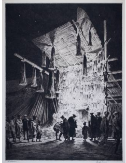
Title: Street Booth in Tokyo, New Year's Eve Date: 1927 Primary Maker: Martin Lewis Medium: Drypoint on wove paper