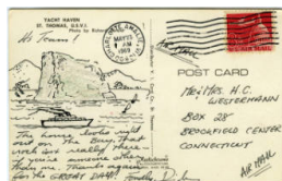
Title: postcard Date: May 23, 1969 Primary Maker: Unknown Artist Medium: Handwritten postcard