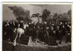
Title: postcard Date: February 5, 1980 Primary Maker: Unknown Artist Medium: Handwritten postcard