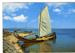
Title: postcard Date: n.d. Primary Maker: Unknown Artist Medium: Handwritten postcard