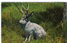
Title: postcard Date: 1979 Primary Maker: Unknown Artist Medium: Handwritten postcard