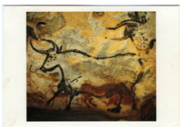
Title: postcard Date: September 14, 1995 Primary Maker: Unknown Artist Medium: Handwritten postcard