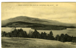
Title: postcard Date: July 25, 1980 Primary Maker: Unknown Artist Medium: Handwritten postcard