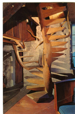
Title: postcard Date: May 21, 1979 Primary Maker: Unknown Artist Medium: Handwritten postcard