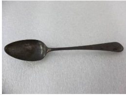
Title: Table Spoon Date: circa 1785 - 1790 Primary Maker: Unknown Artist Medium: Silver