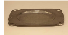
Title: Tray Date: late 19th - early 20th century Primary Maker: Unknown Artist Medium: Hammered metal