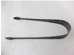
Title: Tongs Date: circa 1800 - 1810 Primary Maker: Unknown Artist Medium: Silver, rosettes on nippers