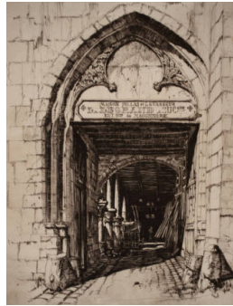
Title: The Mason's House, Senlis Date: n.d. Primary Maker: Samuel Chamberlain Medium: Etching and drypoint