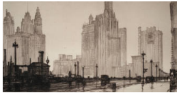
Title: Drizzly Morning in Chicago Date: n.d. Primary Maker: Samuel Chamberlain Medium: Etching