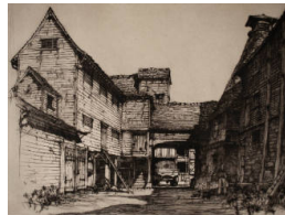
Title: A Stable Court in Essex Date: 1928 Primary Maker: Samuel Chamberlain Medium: Etching and drypoint