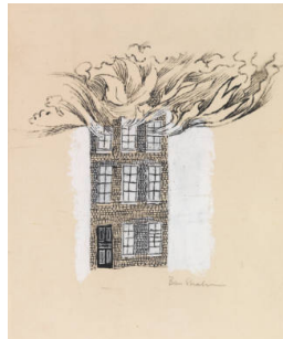
Title: Untitled [I cannot understand how she escaped....It was a miracle. The lord was with her.] Date: 1948 Primary Maker: Ben Shahn Medium: Pen and ink on wove paper, reworked with white pigment