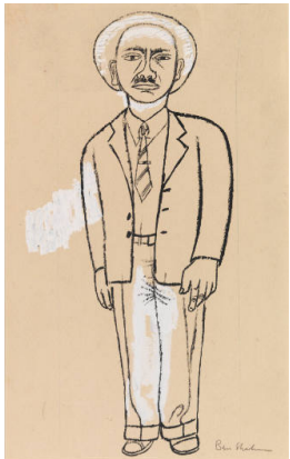
Title: Untitled [How can a black man disappear?] Date: 1948 Primary Maker: Ben Shahn Medium: Pen and ink on wove paper, reworked with white pigment