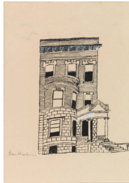
Title: Untitled [...drawing rooms and butler's pantries now rented out as "apartments".] Date: 1948 Primary Maker: Ben Shahn Medium: Pen and ink on wove paper, reworked with white pigment