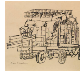
Title: Untitled [...he got his furniture out of storage, and that night he and his wife hired a taxi and took their six young children there.] Date: 1948 Primary Maker: Ben Shahn Medium: Pen and ink on wove paper