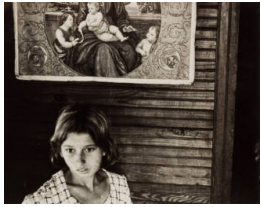
Title: Child of Fortuna Family, Hammond, Louisiana Date: 1935 Primary Maker: Ben Shahn Medium: Gelatin silver print