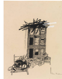
Title: Untitled [If they fixed it up, they'll soon be lined up here... People got no place to go.] Date: 1948 Primary Maker: Ben Shahn Medium: Pen and ink on wove paper, reworked with white pigment