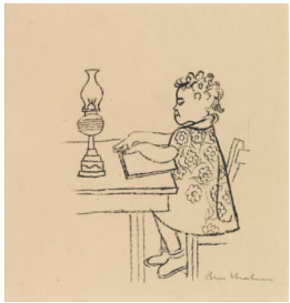
Title: Untitled [...and Velvena was playing at studying though she was only four.] Date: 1948 Primary Maker: Ben Shahn Medium: Pen and ink on wove paper