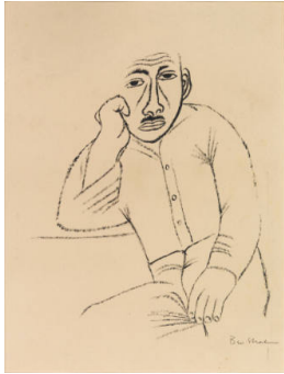
Title: Untitled [When I got to summing up my life I saw my life was unhappy. I was in grief and sorrow.] Date: 1948 Primary Maker: Ben Shahn Medium: Pen and ink on wove paper