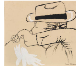
Title: Untitled [...and I weakened down to the ground.] Date: 1948 Primary Maker: Ben Shahn Medium: Pen and ink on wove paper, reworked with white pigment