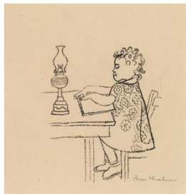
Title: Untitled [...and Velvena was playing at studying though she was only four.] Date: 1948 Primary Maker: Ben Shahn Medium: Pen and ink on wove paper