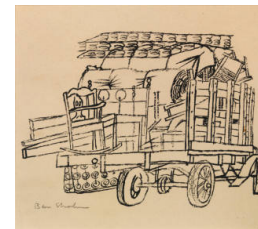
Title: Untitled [...he got his furniture out of storage, and that night he and his wife hired a taxi and took their six young children there.] Date: 1948 Primary Maker: Ben Shahn Medium: Pen and ink on wove paper