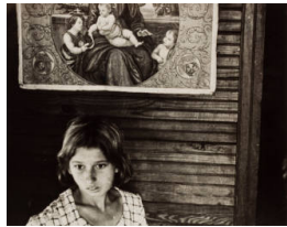
Title: Child of Fortuna Family, Hammond, Louisiana Date: 1935 Primary Maker: Ben Shahn Medium: Gelatin silver print