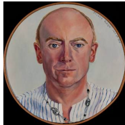
Title: Portrait of Lawrence Alloway Date: July 20, 1979 Primary Maker: Sylvia Sleigh Medium: Oil on canvas