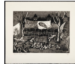
Title: R. Whitman's Happening For Bennington College Date: 1962 Primary Maker: Sylvia Sleigh Medium: Etching and aquatint on wove paper