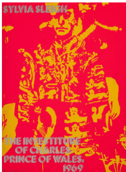
Title: Sylvia Sleigh: The Investiture of Charles, Prince of Wales, 1969 Date: 1971 Primary Maker: Sylvia Sleigh Medium: Color offset lithograph commercially printed on coated paper