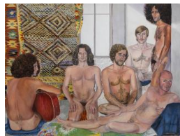
Title: The Turkish Bath Date: 1973 Primary Maker: Sylvia Sleigh Medium: Oil on canvas