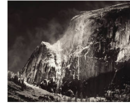
Title: Half Dome, Blowing Snow, Yosemite National Park, California Date: circa 1955 (negative, printed 1976) Primary Maker: Ansel Adams Medium: Gelatin silver print, mounted