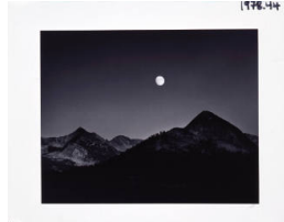
Title: Moonrise from Glacier Point, Yosemite National Park, California Date: circa 1932 - 1976 (negative, printed 1976) Primary Maker: Ansel Adams Medium: Gelatin silver print, mounted