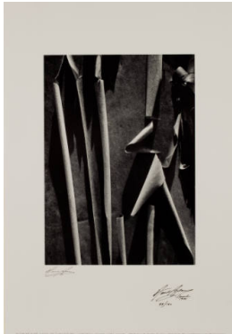
Title: Madrone Bark Date: 1980 Primary Maker: Ansel Adams Medium: Lithograph