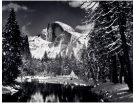
Title: Half Dome, Merced River, Winter, Yosemite National Park, California Date: circa 1932 - 1976 (negative, printed 1976) Primary Maker: Ansel Adams Medium: Gelatin silver print