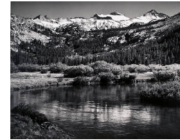
Title: Mt. Lyell and Mt. Mc Clure, Yosemite National Park, California Date: circa 1932 - 1976 (negative, printed 1976) Primary Maker: Ansel Adams Medium: Gelatin silver print, mounted