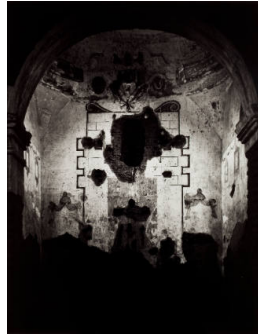
Title: Interior of Tumacacori Mission, Arizona Date: circa 1952 (negative, printed 1976) Primary Maker: Ansel Adams Medium: Gelatin silver print, mounted