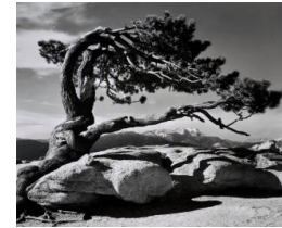
Title: Jeffrey Pine, Sentinel Dome, Yosemite National Park, California Date: circa 1932 - 1976 (negative, printed 1976) Primary Maker: Ansel Adams Medium: Gelatin silver print, mounted