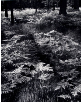
Title: Ferns, Valley Floor, Yosemite National Park, California Date: circa 1932 - 1976 (negative, printed 1976) Primary Maker: Ansel Adams Medium: Gelatin silver print, mounted