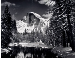
Title: Half Dome, Merced River, Winter, Yosemite National Park, California Date: circa 1932 - 1976 (negative, printed 1976) Primary Maker: Ansel Adams Medium: Gelatin silver print