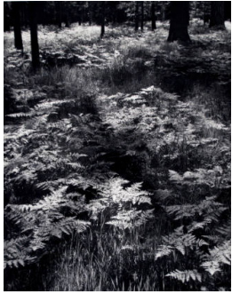
Title: Ferns, Valley Floor, Yosemite National Park, California Date: circa 1932 - 1976 (negative, printed 1976) Primary Maker: Ansel Adams Medium: Gelatin silver print, mounted