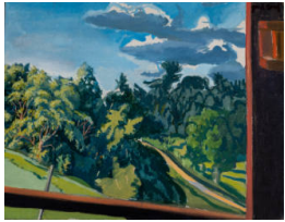
Title: Black Lake Date: 1969 Primary Maker: Jack Beal Medium: Oil on canvas