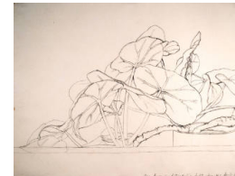
Title: Rex Begonia Date: 1967 Primary Maker: Jack Beal Medium: Pencil on paper