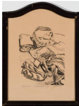
Title: A Packed Still Life Date: n.d. Primary Maker: Jack Beal Medium: Pencil on beige wove paper