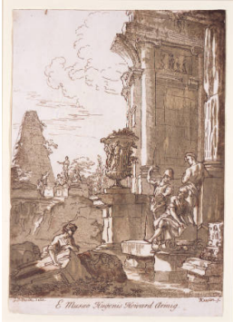
Title: Ruins with Figures (after Giovanni Paolo Panini)

Medium: Etching and chiaroscuro woodcut on wove paper