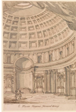
Title: Interior of the Pantheon, Rome (after Giovanni Paolo Panini)

Medium: Etching in brown and woodcut in gray on off-white laid paper