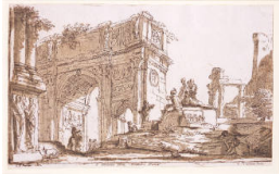
Title: Arch of Constantine, Rome (after Giovanni Paolo Panini)