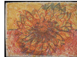
Title: Form, Illusion, Myth No. IV Date: 1938 - 1983 Primary Maker: Pat Steir Medium: Color lithograph