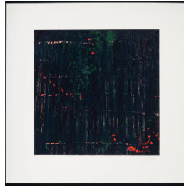
Title: Composition in Dark Date: 1998 Primary Maker: Pat Steir Medium: Four-color lithograph (dark blue, green, red, roseola) and one-color (red) screenprint on Rives BFK wove paper