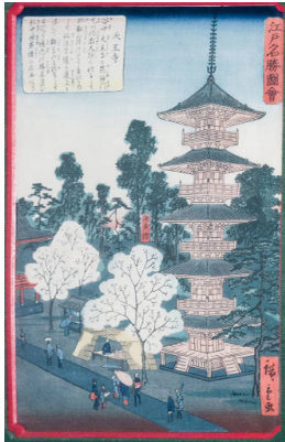
Title: Five-storied Pagoda at Yanaka (From the series "Views of Famous Places in Edo") Date: February 1862 Primary Maker: Hiroshige II Medium: Woodblock print