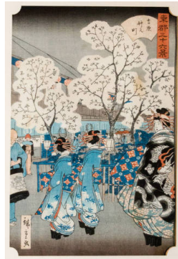
Title: Naka-no-chô in the Yoshiwara (Yoshiwara Naka-no-chô), from the series Thirty-six Views of the Eastern Capital (Tôto sanjûrokkei) Date: 1862 Primary Maker: Hiroshige II Medium: Woodblock print