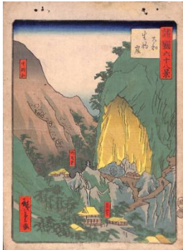
Title: Mt. Ikoma, Yamato Province Date: 1860 Primary Maker: Hiroshige II Medium: Woodblock print