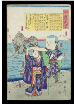
Title: Kinsei no onkata (People Born in Metal Signs), Nigatsu nanoka u no koku uke ni iri tori no toshi made shichinen no aida uke ni iru (At the Hour of the Hare on the 7th Day of the 2nd Month Will Enter a Lucky Cycle and Will Be Lucky for Seven Years through the Year of the Chicken): Fukusuke and Fukujo at Enoshima Date: 1866, 12th month Primary Maker: Hiroshige II Medium: Color woodblock print