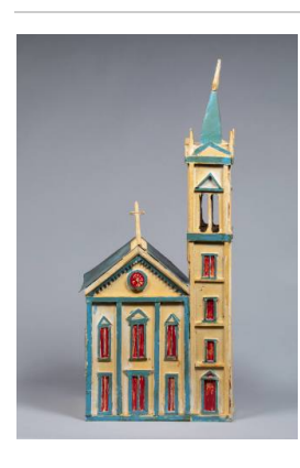
Title: Birdhouse Cathedral