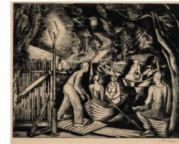
Title: Boat Scene in Central Park