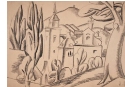
Title: Untitled (landscape)

Medium: Pencil and watercolor on wove paper