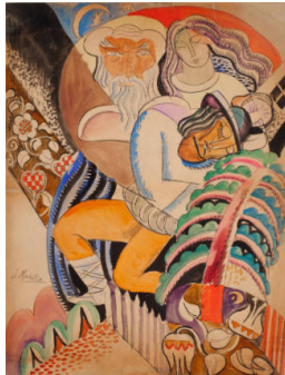
Title: Untitled (Czech folktale)

Medium: Watercolor and conté crayon on paper