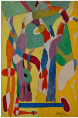
Title: Abstraction-Yellow Trees