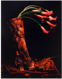
Title: The Red Boot (#1), Red Lingerie