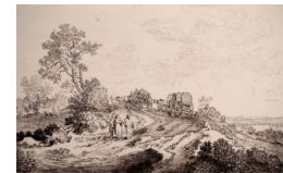
Title: Rural Landscape (after black chalk and India ink wash drawing by Pieter Molyn the Elder) Date: 1773 Primary Maker: William Baillie Medium: Etching and engraving on wove paper