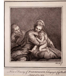
Title: The Holy Family (after drawing by Parmigianino) Date: 1771 Primary Maker: William Baillie Medium: Stipple engraving on wove paper