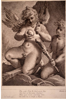
Title: Cupid Burning Hercules's Club (after drawing by Guido Reni) Date: 1777 Primary Maker: William Baillie Medium: Stipple engraving on wove paper