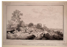
Title: Rural Landscape (after black chalk and India ink wash drawing by Pieter Molyn the Elder) Date: 1773 Primary Maker: William Baillie Medium: Etching and engraving on wove paper