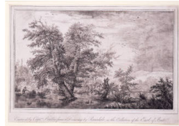
Title: Landscape (after drawing by Jacob van Ruisdael) Date: circa 1775? Primary Maker: William Baillie Medium: Stipple engraving, crayon manner etching and engraving, and etching on chine collé on off-white wove paper