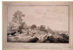
Title: Rural Landscape (after black chalk and India ink wash drawing by Pieter Molyn the Elder) Date: 1773 Primary Maker: William Baillie Medium: Etching and engraving on wove paper