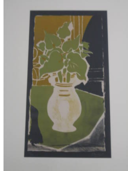
Title: Leaves, Color, Light (Feuilles couleur lumière) Date: 1953 - 1954 Primary Maker: Georges Braque Medium: Color lithograph