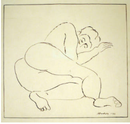
Title: Sleeping Woman Date: 1933 Primary Maker: Horace Brodzky Medium: Pen and ink on wove paper