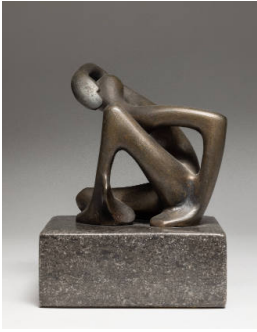
Title: Small Figured Seated Boy Date: n.d. Primary Maker: David Packard Medium: Bronze sculpture affixed to stone base