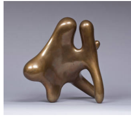
Title: Mediterranean Group (Groupe Méditerranéen) Date: 1941 - 1942 Primary Maker: Hans Arp Medium: Cast polished bronze