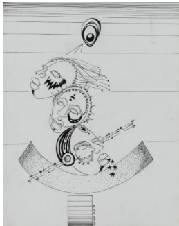
Title: Hyperspace Totem Date: 1974 Primary Maker: Yaoundé Olu Medium: Pen and ink on illustration board