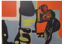
Title: Strange Black Shapes Date: n.d. Primary Maker: Paul Wiegardt Medium: Oil on canvas