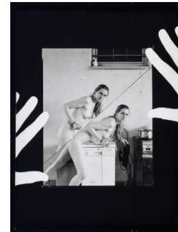
Title: Selbstbedienungstankstelle, 24.1 Date: 2019 Primary Maker: Sophie Thun Medium: Contact print and photogram, silver gelatin print on Baryta paper in artist's frame