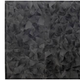
Title: Wonderland: Black Square Date: 2016 Primary Maker: Ma Qiusha Medium: Cement, nylon stockings, plywood, resin, and iron