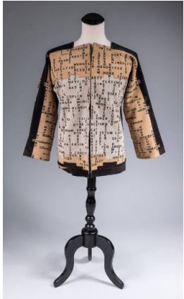
Title: Jazz Scramble Jacket Date: 2015 Primary Maker: Jae Jarrell Medium: Silkscreened cowhide splits