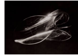
Title: Bending Experiment in Plexiglass Date: June 30, 1941 Primary Maker: László Moholy-Nagy Medium: Gelatin silver print