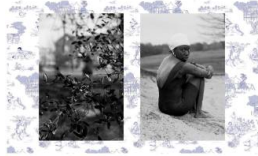
Title: I came at once to the mouth of the tunnel; of the quality; and of the tasked Date: 2019 Primary Maker: Derrick Woods-Morrow Medium: Two archival pigment prints mounted on 'Restoration Toile (I)'