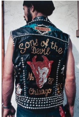
Title: Sons of the Devil Date: 1979 Primary Maker: Luis Medina Medium: Photograph